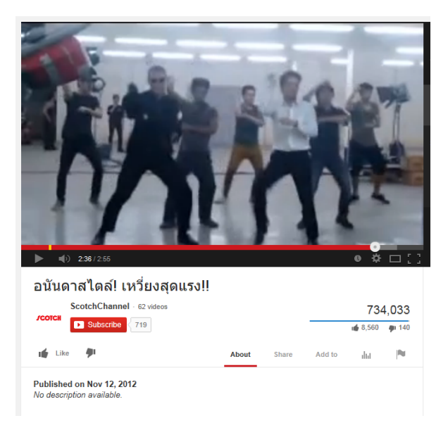
Fig. 1Views and likes information for set up candid clip of Scotch 100 Essence of Chicken in www.youtube.com [6]

According to Youtube.com statistic [6], there're 734,033 views for this clip, which 8,560 people pressed "like" for this clip and 140 people pressed "unlike" for this clip (checked on 12June, 2014)