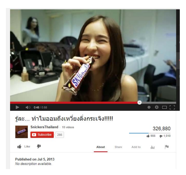
Fig. 3Views and likes information for set up candid clip no.2 of Snickers Chocolate in www.youtube.com [8]

According to Youtube.com statistic[8], there're 319,609 views for this clip, which 893 people pressed "like" for this clip and 1,002 people pressed "unlike" for this clip (checked on 10 February, 2014).