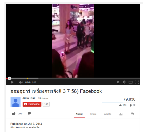
Fig. 2Views and likes information for set up candid clip no.1 of Snickers Chocolate in www.youtube.com [7]

According to Youtube.com statistic [7], there're 79,836 views for this clip, which 143 people pressed "like" for this clip and 90 people pressed "unlike" for this clip (checked on 12 June, 2014)