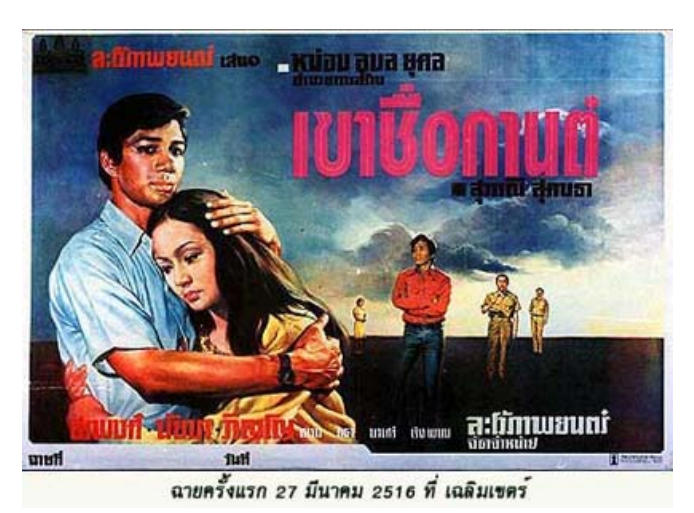
Fig. 3 Poster of "His Name Is KAN'

"His Name Is Kan [3]" of MJ Chatree Chalerm Yukon is one of the first films which truly reflects social problems. The story is about a young doctor with high idealistic thoughts who fights against corruption in the bureaucracy long before ending up his own life in a remote village. The result of this film had faced several obstacles before its release, which was from the need to negotiate with Chom Phon Kittikajo, dictator Prime Minister at that time. SAKA CHARUCHINDA also brought "Talad Prommajaree [3]" (The Virgin Market) to the screenings at the same time. The film was recognized by both critics and viewers.