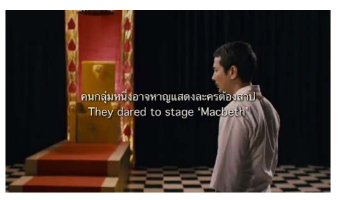
Fig. 6 Picture from "Sheakspeare Must Die"

Political crisis that led to riots and violence in 2010 was presented in the teen movie "Tang Wong" by Kongdej Jaturanrasmee in 2013. With the model of the political crisis event, the making of this teen film, portrays culture and beliefs of Thailand along with scenario of violence in the late 2010 which creates impact on the growth of the characters. Interpolated stories social commentary scoreboards make "Tang Wong" available in limited cinemas; however, the film won Best Film in Supannahong Awards in 2014.