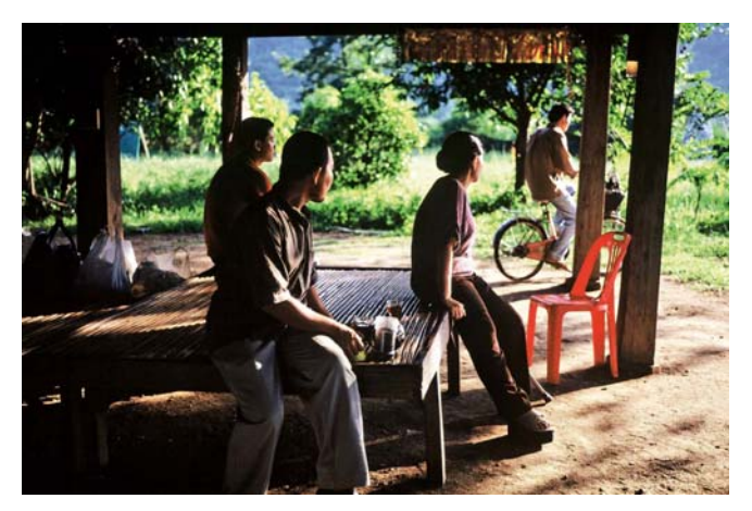
Fig. 5 Picture from "Loong Boonme Lareukchart" (Uncle Boonmee who can recall past lives)